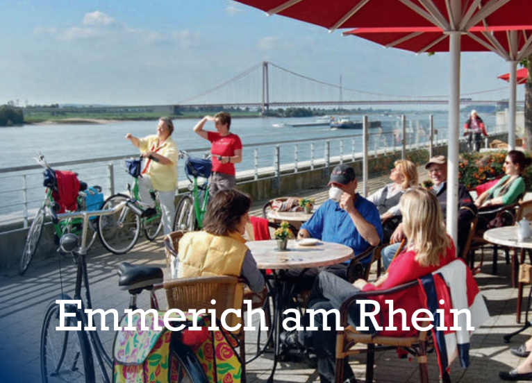
Emmerich am Rhein